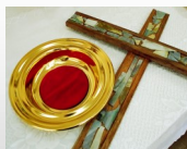
Collection Amounts Redacted

ARE YOU NEW TO OUR AREA and visiting our Parish for the first time? Are you looking for your "home church" here in the mountains of North Carolina? We warmly welcome you to St. William in Murphy and Immaculate Heart of Mary in Hayesville. We hope you feel at home, and we are blessed to be a part of your faith journey. If you are interested in joining our stewardship community, please see one of the ushers after Mass for a Parish Registration Form.